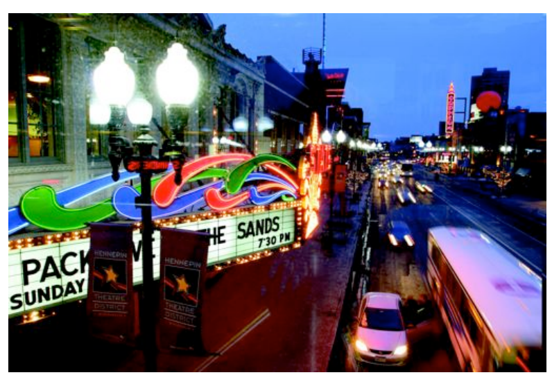
Hennepin Avenue - Theater District.

The Twin Cities feature a wide variety of live music, art, and theater. On October 29, at Orchestra Hall, seven blocks from the hotel, the Minnesota Orchestra, conducted by Sarah Hicks, will present the classic 1935 horror film, Bride of Frankenstein, with Franz Waxman's score performed live (8:00 p.m.). Mel Brooks' Young Frankenstein will be screened afterward (10 p.m.). Also at Orchestra Hall, Herbie Hancock will perform a solo concert on October 28 (8:00 p.m.). The Dakota Jazz Club and Restaurant, five blocks from the hotel, features live jazz seven nights a week; doors open at 5:30. The Fine Line Music Café is located in the heart of the Warehouse District, five blocks from the hotel, amidst many popular restaurants and bars. The world-renowned Guthrie Theater, about a mile from the conference hotel, will present Much Ado About Nothing and The Burial at Thebes October 27-29 (7:30 p.m.) and October 29-30 (1:00 p.m.). The Walker Art Center, 1.5 miles from the hotel, focuses on contemporary visual, performing, and media arts, and includes a variety of exhibits and dance performances during the conference weekend.