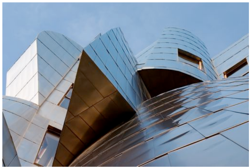
After a major expansion project, the Frederick R. Weisman Art Museum at the University of Minnesota in Minneapolis is scheduled to reopen on October 2, 2011.

The Society for Music Theory will hold its thirty-fourth Annual Meeting from October 27–30 at the Marriott City Center in Minneapolis. Centrally located in culturally rich downtown Minneapolis, this top-ranked hotel connects via skyway to shops, restaurants, and theaters. In walking distance to Orchestra Hall, the Guthrie Theater, Nicollet Mall, and other attractions, the conference hotel is also easily accessible by train to the airport and to the Mall of America.